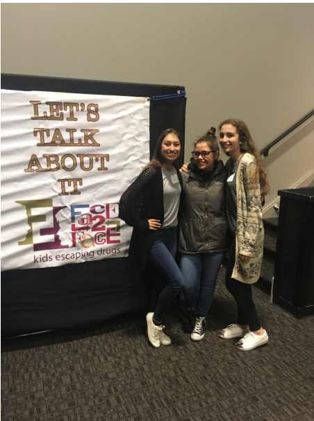
Face 2 Face Awareness Kids Escaping Drugs 2018 Seminar

participated in several activities including painting rocks, untangling ropes in a group activity, as well as discussing what being a leader means to us. To me, the most powerful group session was when it was revealed that they had hidden a Kids Escaping Drugs recovered addict in our group with us all day, posed as a student. He opened up to us about his story, and how he has recovered in his life. Overall, the Kids Escaping Drugs seminar was a very powerful and moving experience for all who attended.