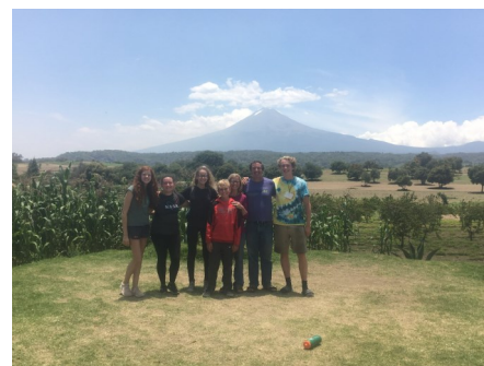
The St. Mary's contingency in front of Popo.

"Going to Mexico made me feel as though I was part of something bigger. I was apart of the bigger picture. My life didn't just revolve around Buffalo and St. Mary's and everything local. I became a part of the world. I became bigger. I know more now, I feel more now. I can empathize better than I could before I went. I've learned to view things through a wider lens than just staying in the same bubble I've been in for quite some time now. Having been back home, I never knew I could miss a place as much as I miss Mexico, and I cannot wait to go back."