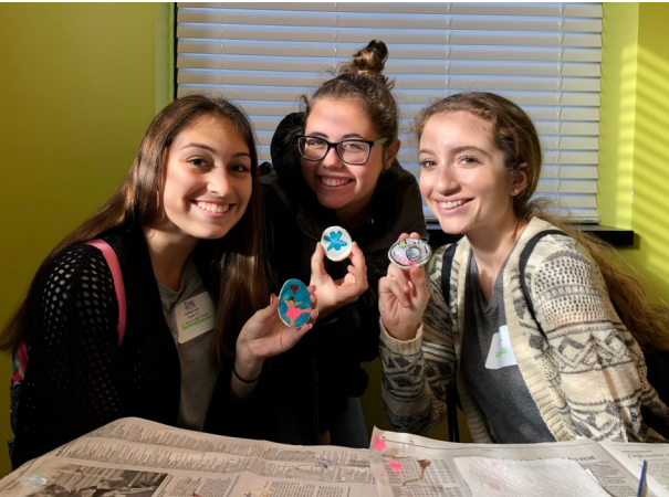
We were each given a rock to paint something we would miss about ourselves if we faced an addiction.