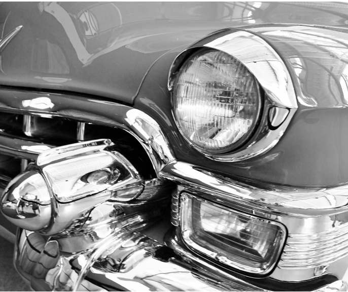
1959 Coupe Deville Cadillac