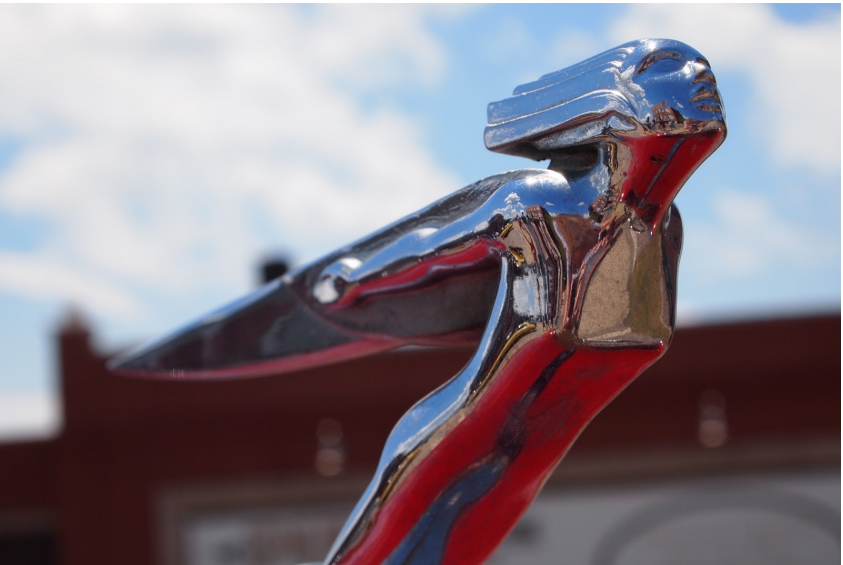
1936 Auburn Speedster “Flying Lady” Hood Ornament