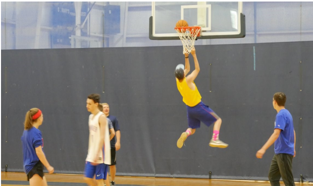
Close enough to a dunk.