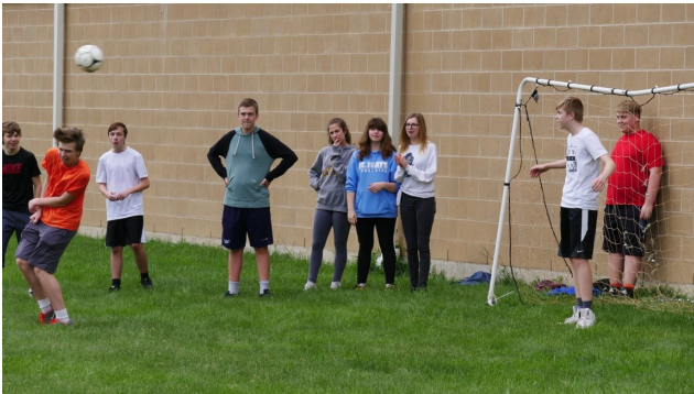
Freshmen took over the soccer nets.