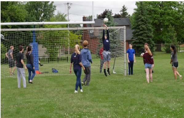
...with the save!