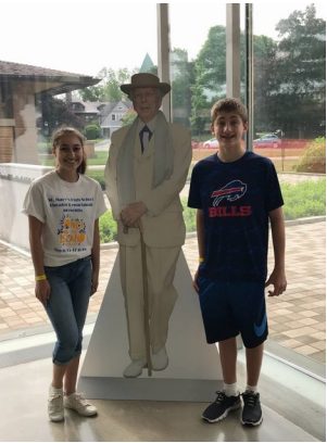
Frank Lloyd Wright at the Marin House