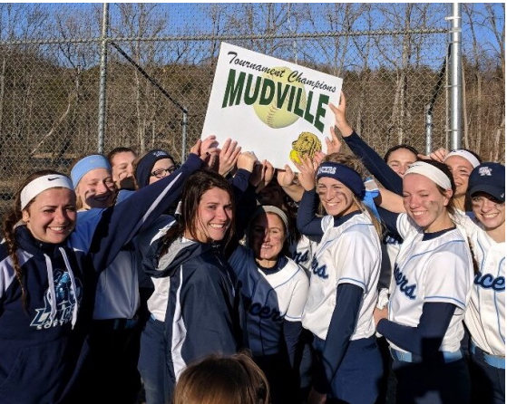
To begin the season, the Lancers took a trip to Mudville (in Herkimer, NY) and took home the tournament championship!