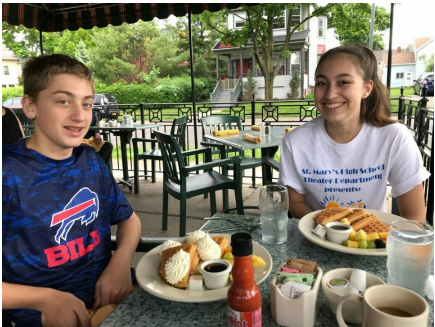
Breakfast at Betty's