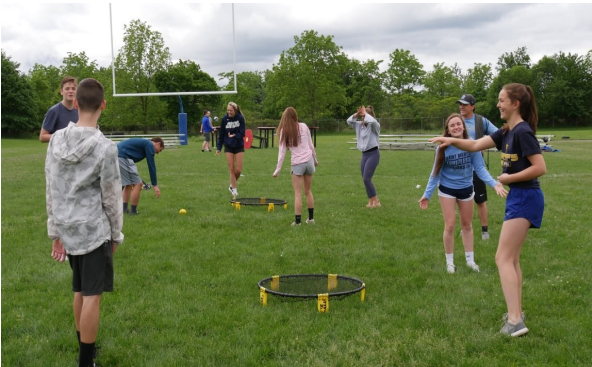
Juniors engaged in an intense game of Spikeball.