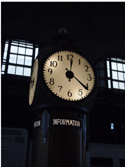
Main concourse clock