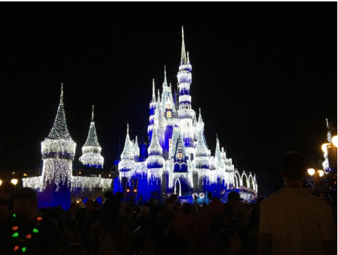
Cinderella Castle decked out for Christmas in the Magic Kingdom