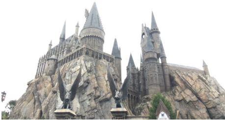
Hogwarts at Universal's Wizarding World of Harry Potter