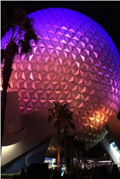
Nighttime in Epcot