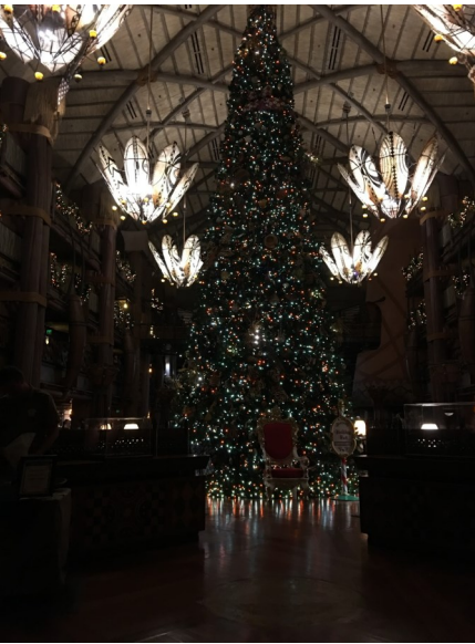
Christmas tree inside Disney's Animal Kingdom Lodge

We took a lot of pictures to help us remember the trip we had in these fun places. You can see some of them below!