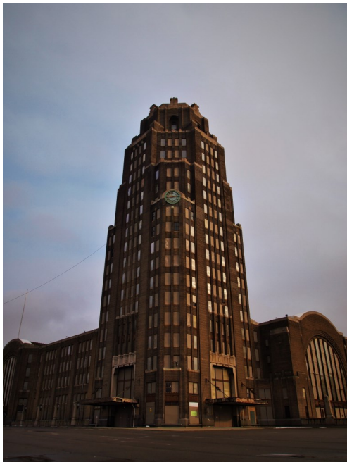
Buffalo Central Terminal—Exterior